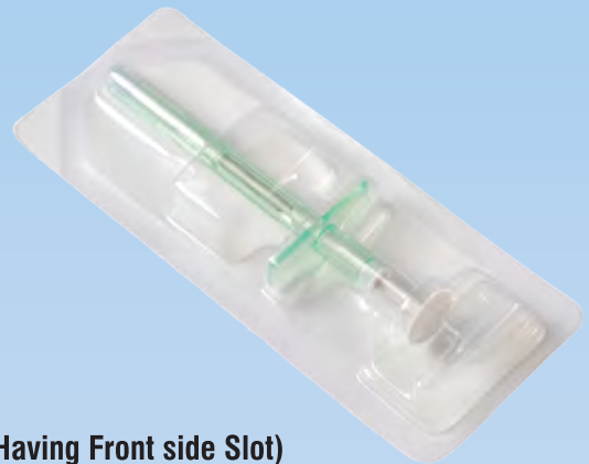
(Having Front side Slot)